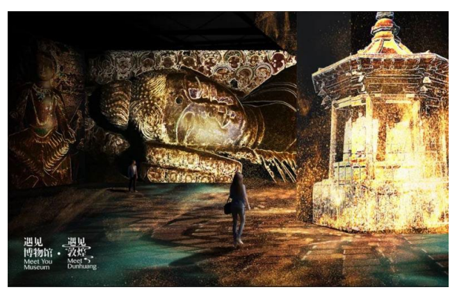
Figure 2. Digital Museum "Meet Dunhuang"