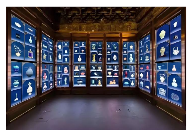
Figure 1. Digital artwork "Digital Treasure Pavilion"